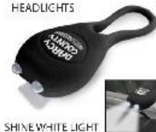
SHINE WHITE LIGHT