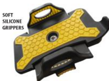
SOFT SILICONE GRIPPERS