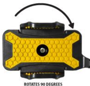
ROTATES 90 DEGREES