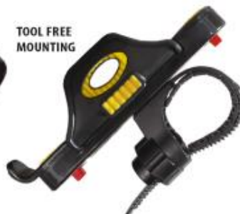
TOOL FREE MOUNTING