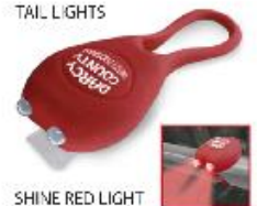
SHINE RED LIGHT

Part Numbers Headlights: BkHL LBBH-1, BluHL LBBH-2, GrnHL LBBH-3, WhiteHL LBBH-4, YellowHL LBBH-5, PinkHL LBBH-6, BabyBluHL LBBH-7, MintyGrnHL LBBH-8, LavenderHL LBBH-9, RedHL LBBH-10,